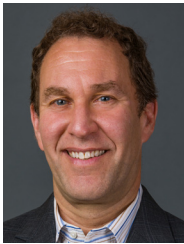
Jeffrey Mogil, Ph.D.

Pain, of course, has a protective function. It helps us avoid injury by prompting us, often involuntarily, to withdraw from potentially damaging stimuli—by dropping a hot pan, for example. However, neuropathic pain, which is often chronic and can occur after damage to the nervous system, is a disease condition that has no protective role. Although glia play no part in transmitting normal pain signals, recent research has implicated glial cells in chronic neuropathic pain conditions—for example, those emerging after injury or surgery.